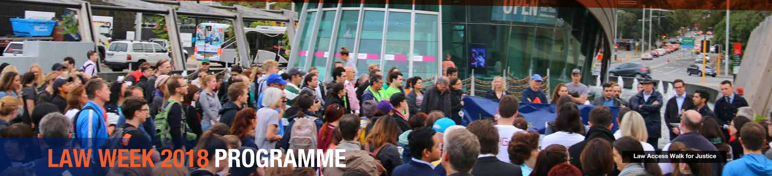
Law Access Walk for Justice